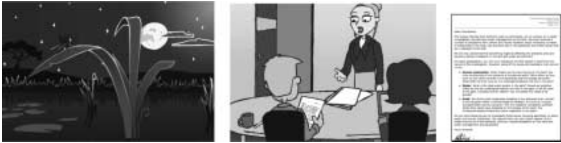
Figure 1. Mosquitoes in the park, the administrators are concerned, letter to experts

programme incorporates an authentic context for the study of Year 10 geography. In a learning challenge designed to enable students to learn key geography skills (described in detail in Brickell & Herrington, 2006), an authentic context is provided in the form of a brief animation (Figure 1). The park is experiencing problems with mosquitoes, smelly ponds and rats attracted by food scraps and other rubbish left by visitors. The administrators of the park are concerned and write a letter to call for the help of “experts”—the geography students. They are required to investigate the problem (which they do on an excursion to the park and in research conducted before and after the visit), and to present a report to the park authorities.