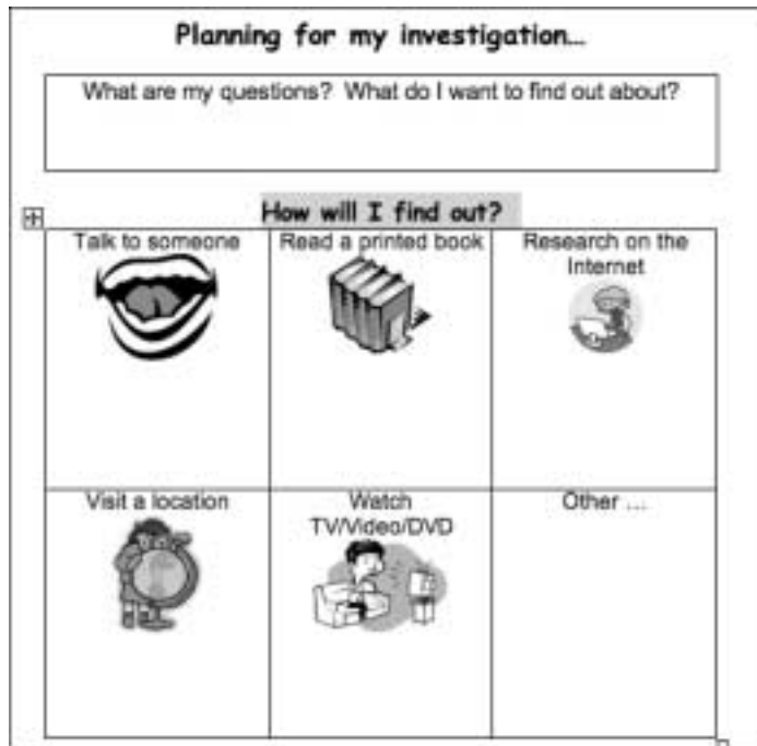
Figure 3. Planning sheet for students to nominate a range of resources

The use of word-processing software as an organizational tool allows students to plan an activity or task in depth but also to reflect upon the nature of sources of information and the strengths of each particular medium, and the value of the particular source.