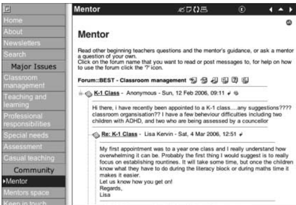
Figure 6. Question and answer on classroom management on the BEST site