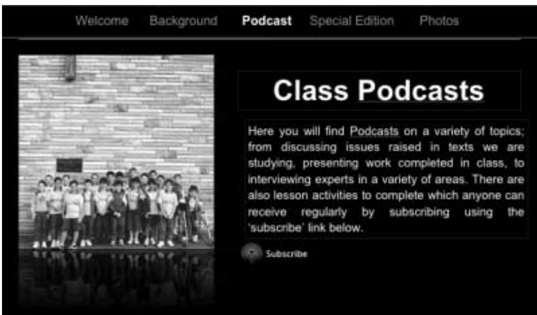
Figure 2. Introduction screen to student podcasts