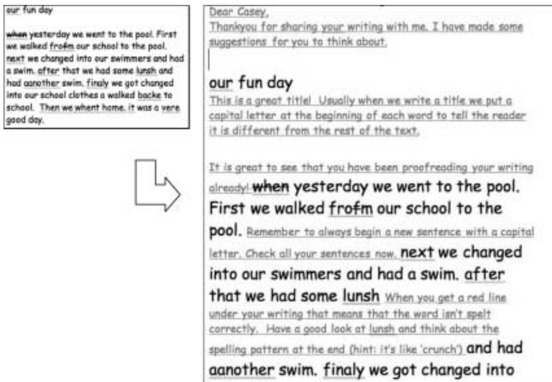
Figure 5. Original passage of student writing (left) and passage annotated by teacher in tracking mode (right)

tracking tool embedded within the software, then reviewed these writing samples providing a written commentary for each individual student (see example in Figure 5).